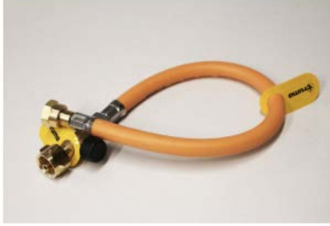
Truma Korkeapaineletku letkunrikkoventtiilillä 450 mm